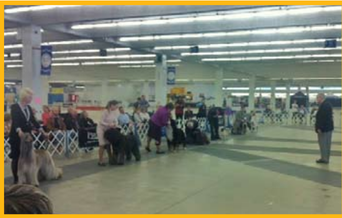
BEST IN SHOW FINAL LINE UP The Skye Terrier was the Reserve Best in Show