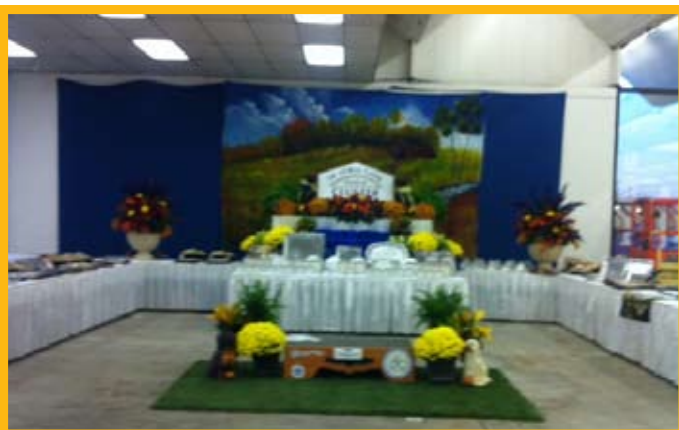
THE ENTIRE TROPHY TABLE