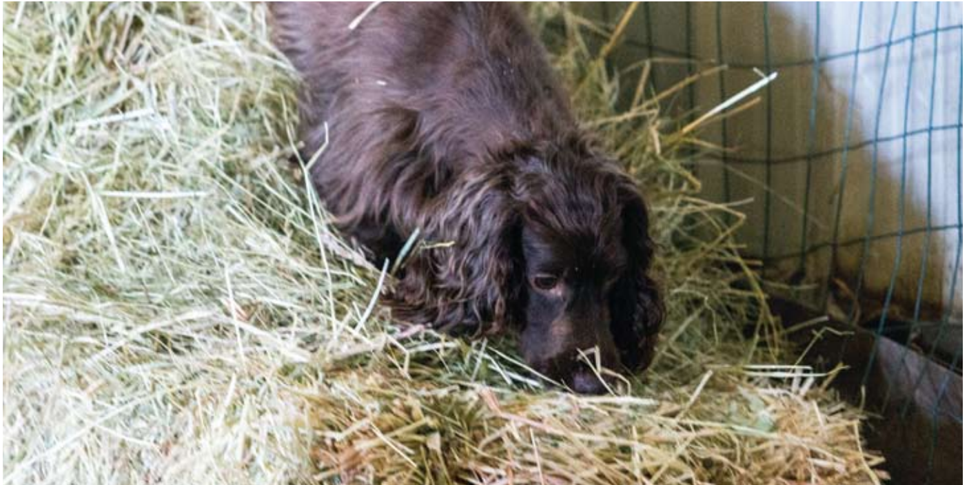
Otter, an English Cocker Spaniel, was the first dog to earn the barn hunt masters title.

In the first year, BHA bestowed nearly 2,500 titles and registered more than 5,000 dogs. Barn hunt is open to all dogs, including mixed-breeds, and an amazing variety, from Chihuahuas to Mastiffs, has been successful.