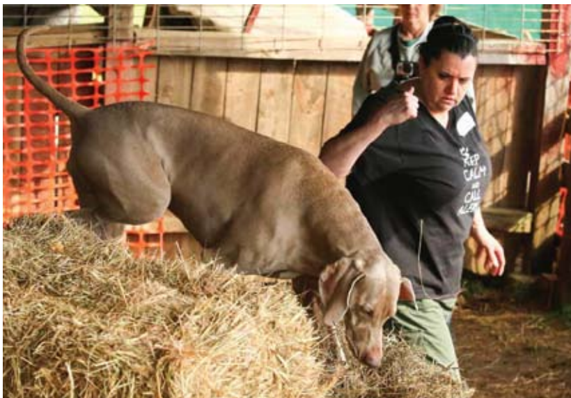
“I smell a rat!” Barn hunt allows Lexi to put her nose and energy to good use.

my rats in a wire cage for an introduction portion at a clinic. There was one timid dog I was having a hard time getting interested in the rat. The owner even mentioned that she was extremely shy, and this was probably not going to be her thing. As my rat sat on the ground in the cage, the dog stuck her nose right up to the cage to get a good smell. My rat is known to be mischievous, so he came nose to nose with her to smell her too and then bit her on her nose. The dog totally switched gears and wanted to get back at my rat for doing that! I was mortified, believing that the owner was going to be upset. On the contrary, she was ecstatic that her dog became engaged.” 🐾